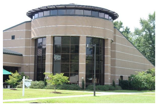
BCC Student Resource Center

In 1997, BCC changed from the quarter system to the semester system to facilitate articulation with universities. A $1 million appropriation from a legislative grant allowed expansion of the welding and industrial maintenance buildings in 2008.