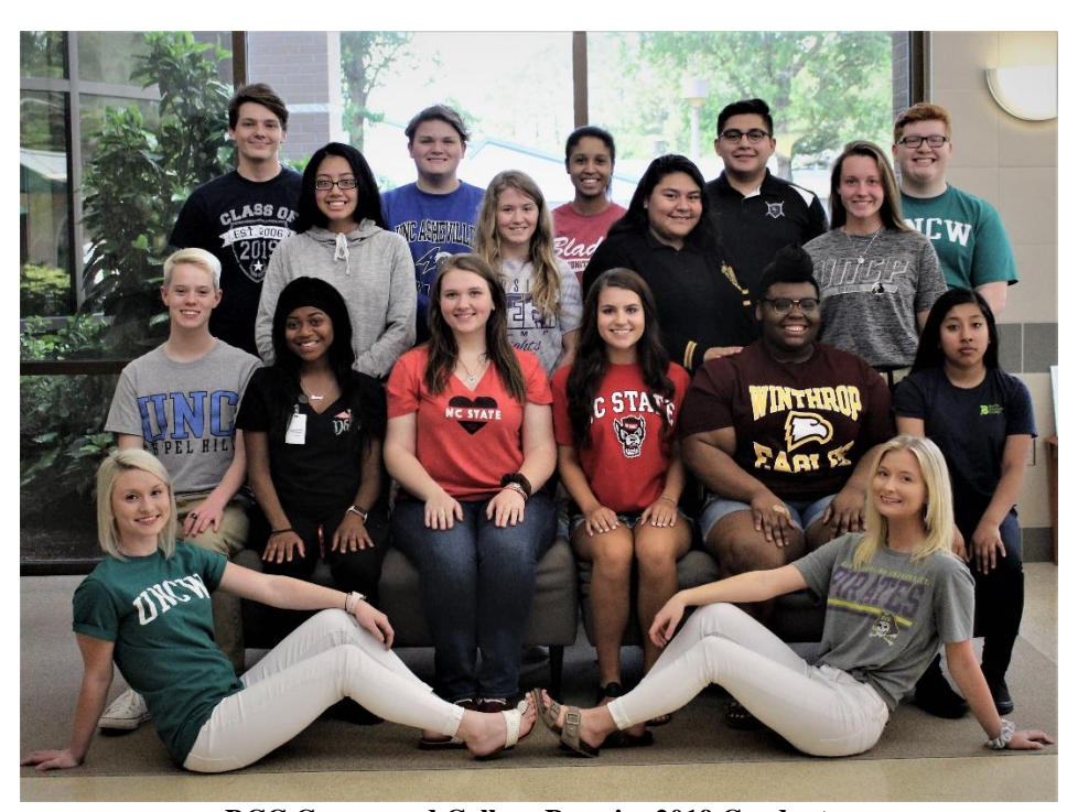
BCC Career and College Promise 2019 Graduates